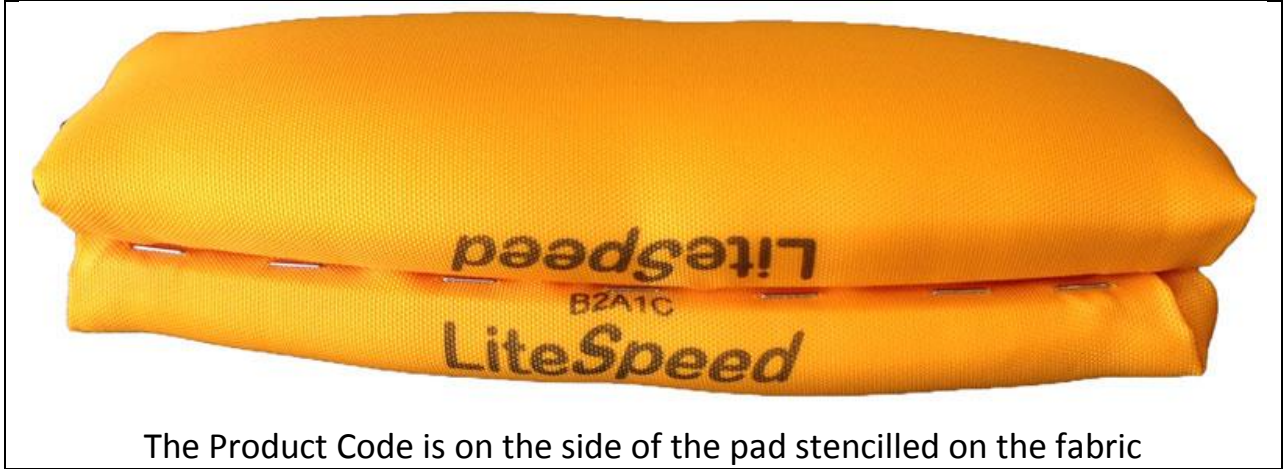
The Product Code is on the side of the pad stencilled on the fabric